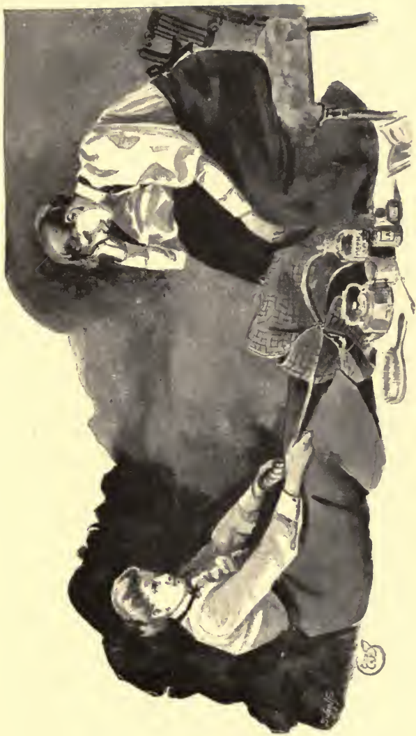
Packing the "hold-alls."